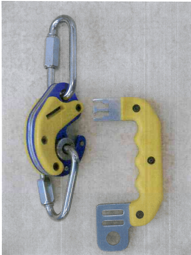
Safety Engineering Self Belay Connector, type SB-1